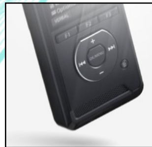
Resilient in everyday dictation