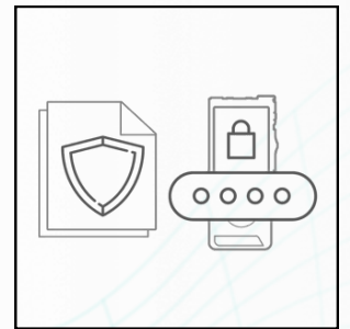
256-BIT Encryption and 4-Digit PIN Lock