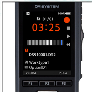
Full color screen