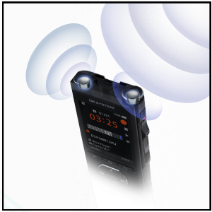
Intelligent two microphone system