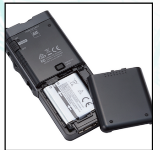
Rechargeable Lithium-ion battery

The DS-9100 offers advanced features such as superior audio beam forming noise cancellation, 256-BIT AES file encryption, streamlining workflow and enhancing dictation management efficiency. Its intelligent dual microphones effectively prioritize the speaker's voice and suppress ambient noise in various settings such as offices and hospitals. The triple-layer studio-quality filter guarantees precise voice capture whilst minimizing unwanted sounds such as breath and wind vibrations. This results in superior accuracy, ultimately improving workflow efficiency.